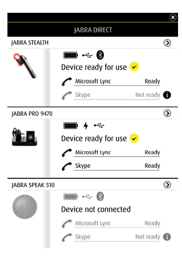
Jabra Direct Dashboard